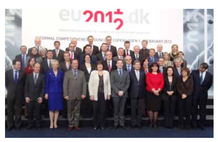
Ministerial Conference on Horizon 2020, February 2012