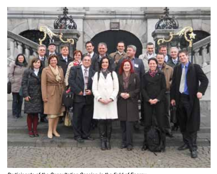
Participants of the Consultation Session in the field of Energy in front of the Maastricht Town Hall

Find the agenda and presentations here http://wbc-inco.net/object/event/9582 Videos available: WBC-INCO.NET at E2C Maastricht ■ http://wbc-inco.net/object/news/3532