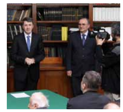
Celebration of the 125th Anniversary of the Astronomical Observatory

On April 9, 2012, the Astronomical Observatory of Belgrade (AOB) celebrated its 125th anniversary. The ceremony, which took place in the library of the AOB, was attended by numerous distinguished quests. On this occasion, the Minister of Education and Science, Žarko Obradović expressed satisfaction with the fact that Serbia has the Astronomical Observatory as a scientific institution with such a long tradition. Among other guests, the celebration was