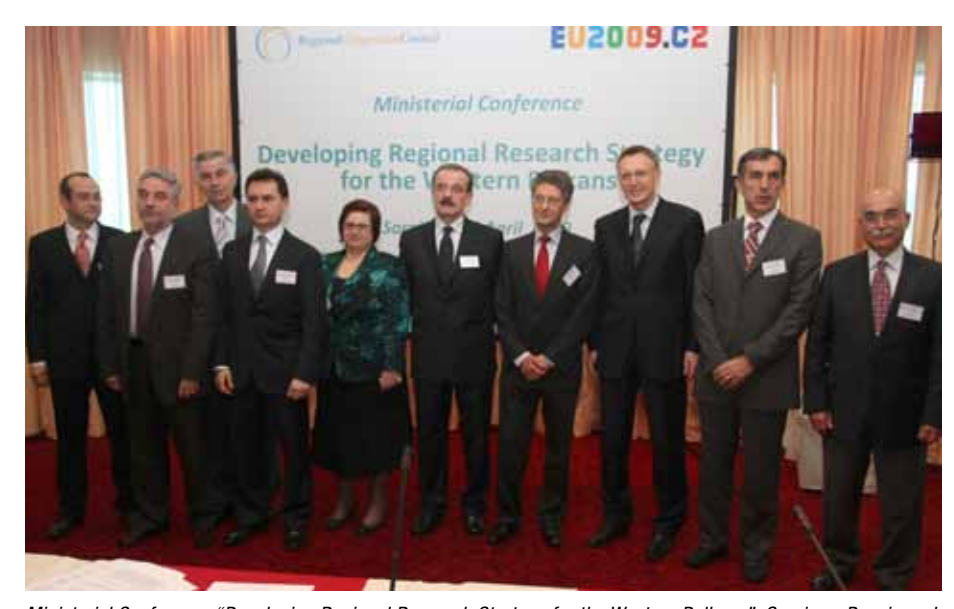
Ministerial Conference "Developing Regional Research Strategy for the Western Balkans", Sarajevo, Bosnia and Herzegovina, April 24, 2009

The first half of the two-year technical assistance project will focus on knowledge sharing and preparation of the draft strategy as well as country action plans by the beneficiary entities. The remaining twelve months would be dedicated to the consultation/dissemination of the draft strategy among the different stakeholders in the region and preparation of the final draft strategy and action plans.