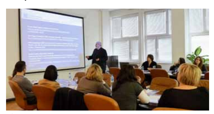
4<sup>th</sup> Training for representatives of the University of Zagreb, organised within the project "Mapping Technology at the University of Zagreb", held 2011

Beneficiaries of the first call include a number of successful projects: the project "Technology mapping at University of Zagreb", beneficiary University of Zagreb. The project includes five partners at the University of Zagreb: the Faculty of Agriculture, the Faculty of Chemical Engineering and Technology, the Faculty of Food Technology and Biotechnology, the Faculty of Science, and the School of Medicine; and three associates: the Croatian Agency for SMEs (HAMAG), the Croatian Chamber of Economy, and the Croatian Employers Association. The overall objective of the project is to strengthen technology transfer and commercialization capacities of the University of Zagreb in order to contribute to sustainable regional development and industry competitiveness of high value added sectors of the economy and knowledge-based industry and SME's in Croatia.