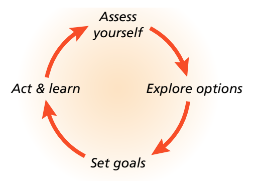
Figure 3.1. Career decision-making cycle