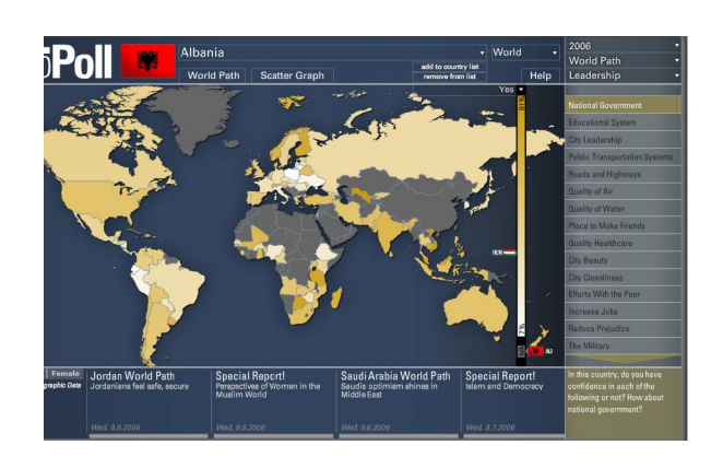
Illustration of the web-based portal ▶

Immediate access to the voice of the Balkan people will be available through membership of a state-of the-art, web-based portal. This key to the Balkans will allow members to perform detailed searches, track key indicators, compare data, and always have the latest available information on what the citizens of South-Eastern Europe are thinking and feeling.