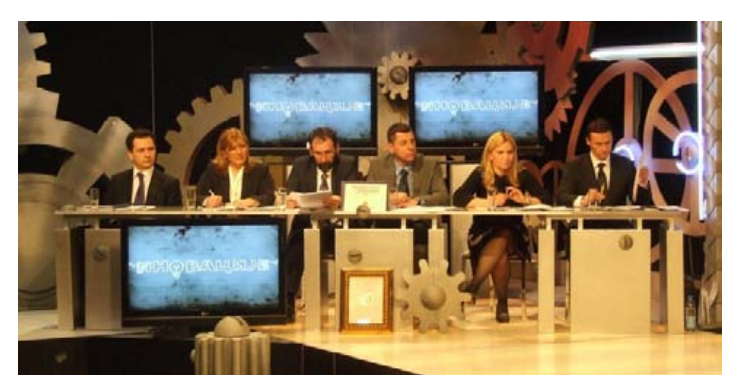
Jury of the prize for the best technological innovation.

The first prize for the best technological innovation in Serbia in 2010 in the category of realised innovation was awarded to the team "Top 14" for their innovation "Production of chemically modified inverters". A total of six teams participated in the final lap of the competition.